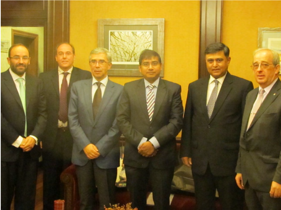
B) Visit to the Hotel Management School of Galicia (CSHG)